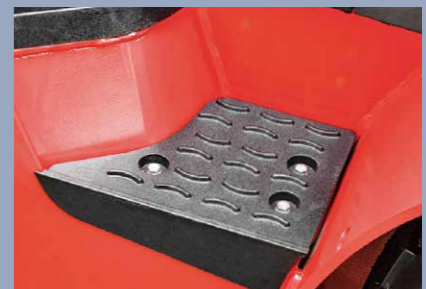
Enlarged boarding step space allows more convenience for boarding.