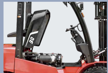
The wide-open hood, increasing maintenance space by 10%