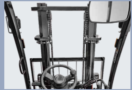
Ultra-wide-view mast and the front view of the driver broadened by 8%

The optimized heat dissipation system, improved counterweight heat dissipation channel and reduced wind resistance of the radiator enable the cooling efficiency to rise by 10%.