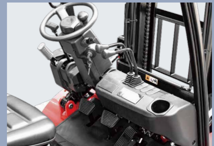
The semi-enclosed instrument console make the entire forklift look compact and stylish.