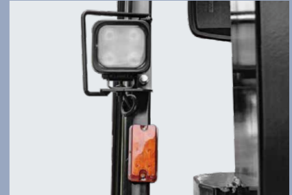
The LED lighting system is provided in the entire forklift, which can save energy and power and greatly improve the performance and service life of lights.