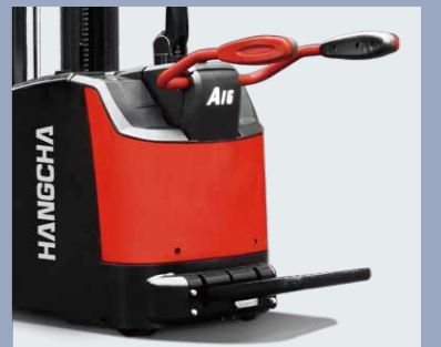
The integrated stamping molded guardrail offers better protection for the operator