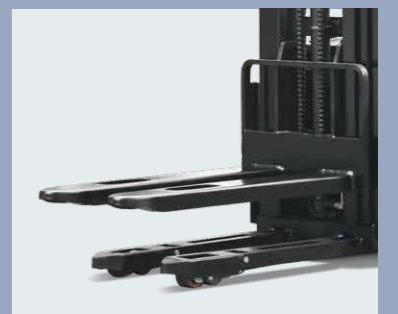
Tandem load wheel