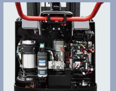
Back cover can be opened fully, and all components and parts are clear at a glance, which is very convenient for maintenance of the entire machine