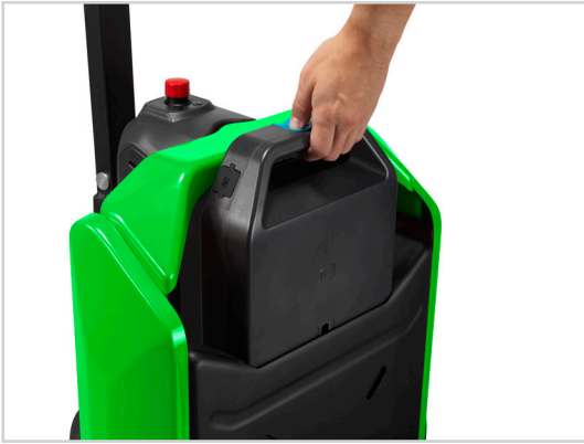
Ultra-simple battery changing