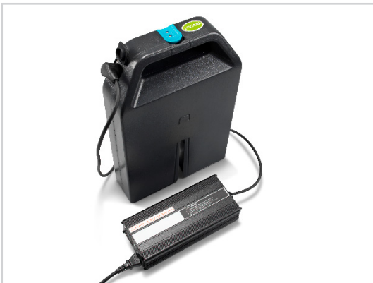
Li-ion 24V-36Ah battery Fast charging in ~ 2.5 hours