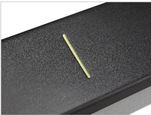
Marks for easy pallet handling